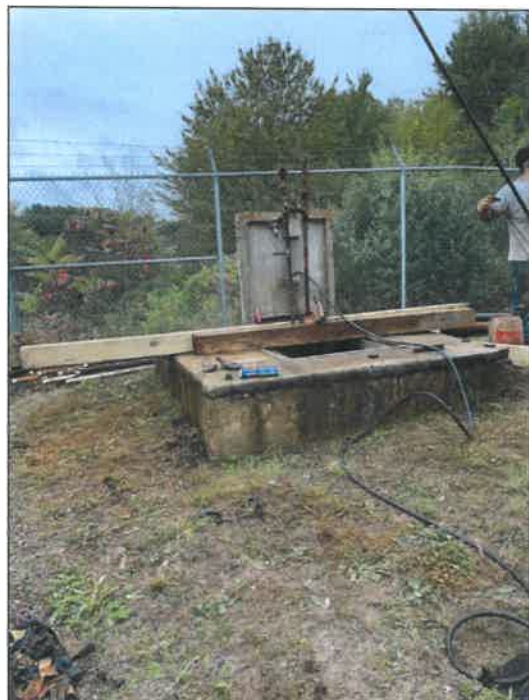
Installation of inflatable packer and AquaFreed injection equipment - 10/1/2019