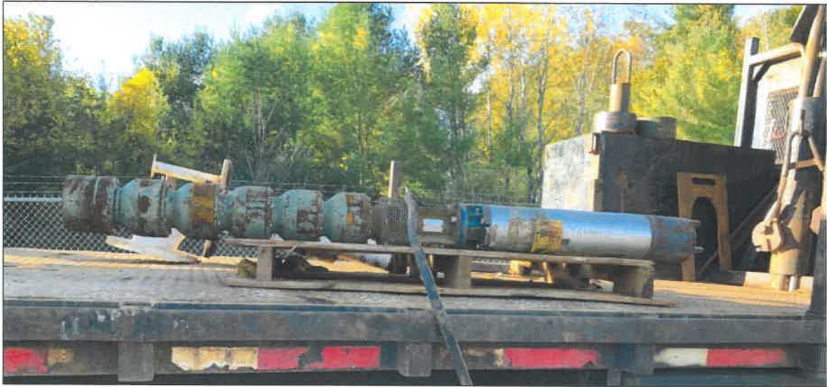
Steam cleaned and inspected pump and motor returned to Bedrock Well #2 - 10/18/2019