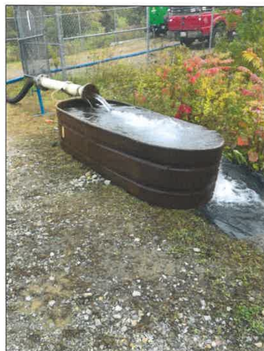
Iron, manganese, and sediment removal by pumping and surging (left – 10/4/2019) and decrease in sediment and iron/manganese (right – 10/8/2019)