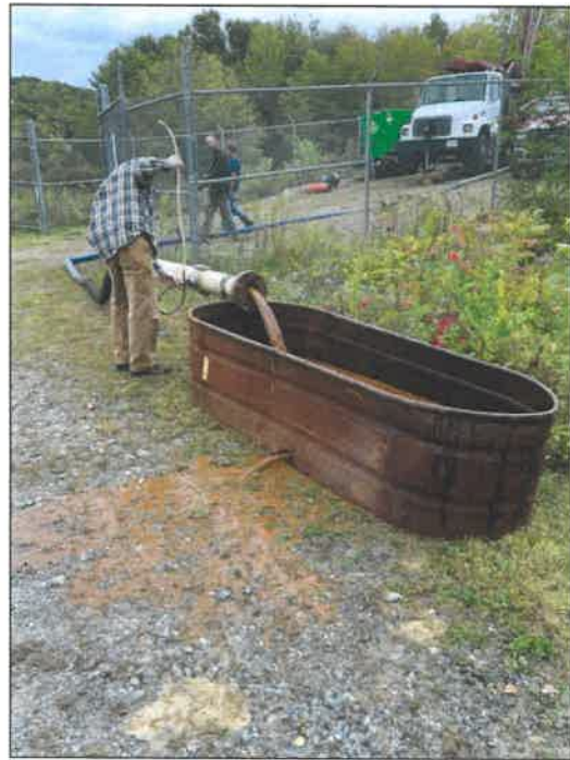
Installation of surge blocks and equipment (left) and initial surge of Bedrock Well #2 (right) - 10/1/2019