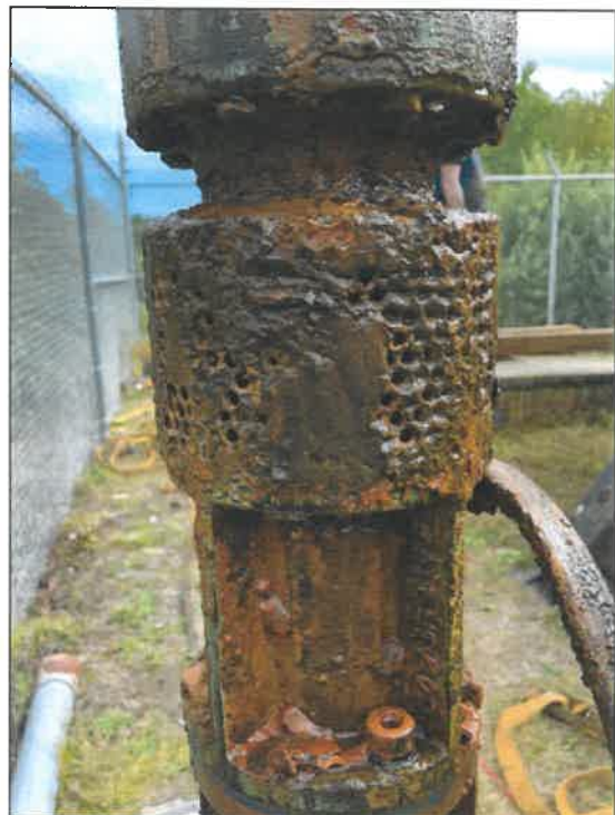
Christensen 6CLC-5 Pump and Centripro 15 HP Motor (left) and clogged intake screen (right) - 9/30/2019