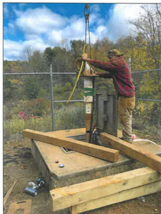
Reinstallation of pump and motor (left) and column piping and stilling wells (right) - 10/18/2019