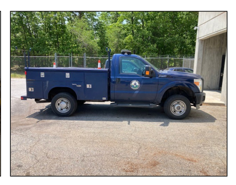
The Sewer CIP

The 2024 Sewer CIP has been provided through the main CIP book. We will look at those numbers in more detail through this individual departmental review. The Wastewater 2024 CIP may be the most important of the departments this year from a financial perspective. These numbers are being utilized as a new pricing model is being developed, and that model should be ready shortly. The size of the financial commitments here, regardless of the source of funding (enterprise vs. taxpayer) will require some degree of bond finance, as will water. I will produce the current bond schedule for the Town of Seabrook so that discussion can be had.